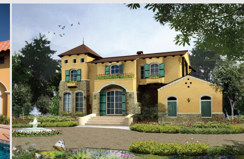
MAGNOLIAS French Country