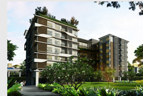
Whizdom @ PUNNAWITHI STATION