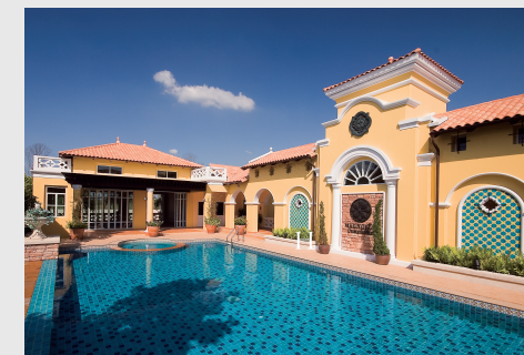
MAGNOLIAS SOUTHERN CALIFORNIA