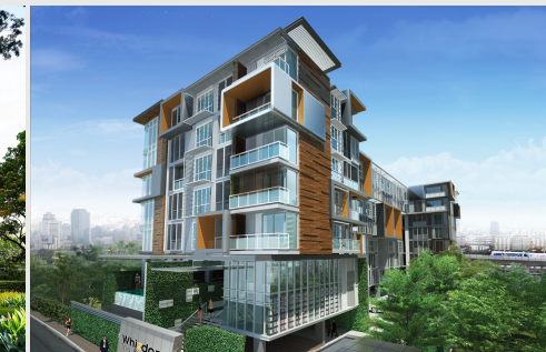
Whizdom The Exclusive

GLOBAL EVOLUTION RESPONSIVE DESIGN ARCHITECTURE